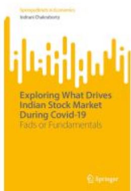
Exploring What Drives Indian Stock Market During Covid-19 Ladenpreis: 49,49EUR

Wir haben andere Produkte gefunden, die Ihnen gefallen könnten!