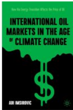
International Oil Markets in the Age of Climate Change Ladenpreis: 49,49EUR