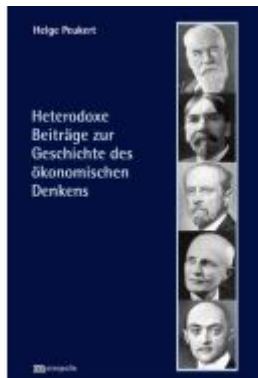
Heterodoxe Beiträge zur Geschichte des ökonomischen Denkens Ladenpreis: 59,70EUR