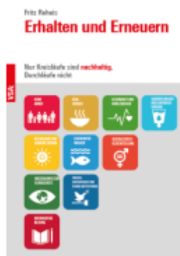
Erhalten und Erneuern Ladenpreis: 13,20EUR