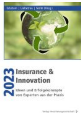
Insurance & Innovation 2023 Ladenpreis: 41,00EUR