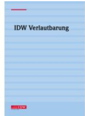
IDW Praxishinweis: Ausgestaltung und Prüfung des internen Kontrollsystems zur Aufstellung eines Nachhaltigkeitsberichts unter Beachtung des IDW PS 982 (IDW Praxishinweis 4/2023) Ladenpreis: 53,50EUR