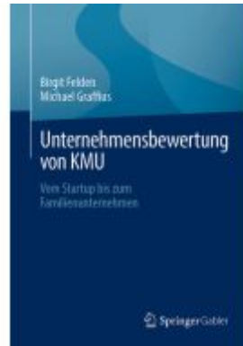
Unternehmensbewertung von KMU Ladenpreis: 46,25EUR