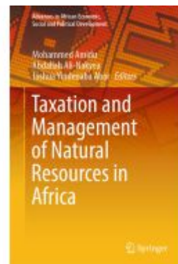
Taxation and Management of Natural Resources in Africa Ladenpreis: 175,99EUR