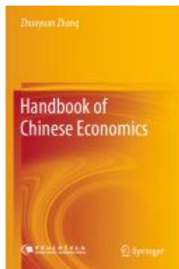
Handbook of Chinese Economics Ladenpreis: 329,99EUR