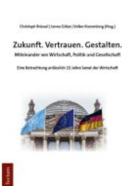
Zukunft. Vertrauen. Gestalten. Ladenpreis: 40,10EUR

Wir haben andere Produkte gefunden, die Ihnen gefallen könnten!