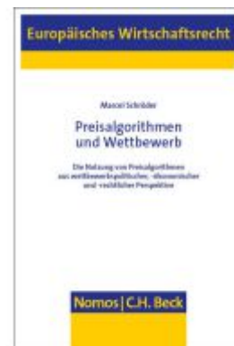
Preisalgorithmen und Wettbewerb Ladenpreis: 112,10EUR