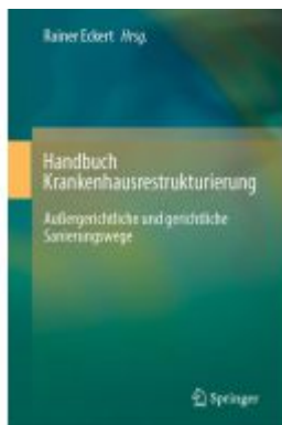
Handbuch Krankenhausrestrukturierung Ladenpreis: 205,60EUR