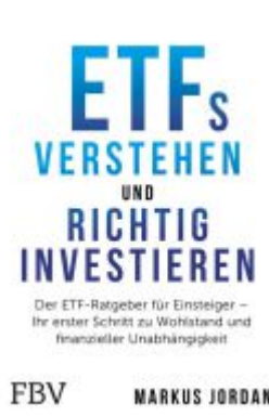
ETFs verstehen und richtig investieren Ladenpreis: 19,60EUR