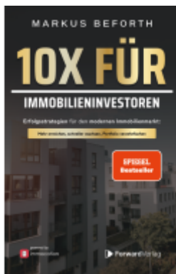
10X für Immobilieninvestoren Ladenpreis: 18,00EUR