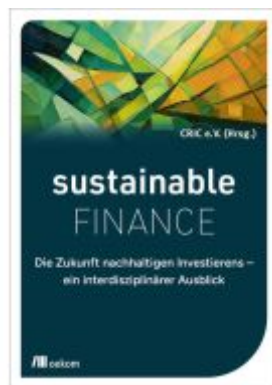
Sustainable Finance Ladenpreis: 35,00EUR