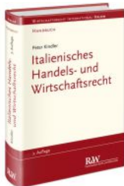
Italienisches Handels- und Wirtschaftsrecht Ladenpreis: 142,90EUR