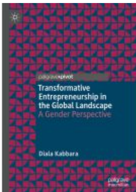
Transformative Entrepreneurship in the Global Landscape Ladenpreis: 43,99EUR

Wir haben andere Produkte gefunden, die Ihnen gefallen könnten!