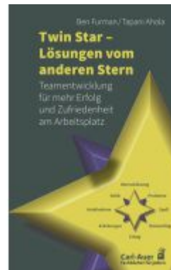
Twin Star - Lösungen vom anderen Stern Ladenpreis: 20,60EUR