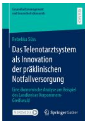
Das Telenotarztsystem als Innovation der präklinischen Notfallversorgung Ladenpreis: 77,09EUR