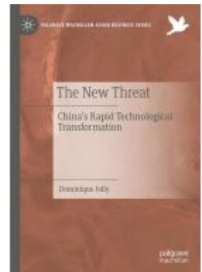
The New Threat Ladenpreis: 49,49EUR