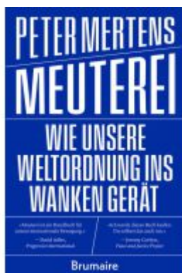
Meuterei Ladenpreis: 19,00EUR