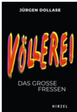
Völlerei Ladenpreis: 17,50EUR