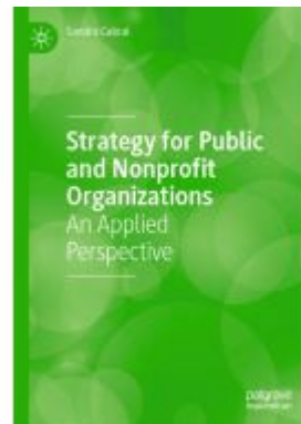
Strategy for Public and Nonprofit Organizations Ladenpreis: 164,99EUR