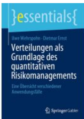
Verteilungen als Grundlage des quantitativen Risikomanagements Ladenpreis: 15,41EUR