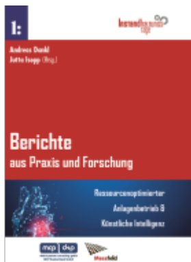
Berichte aus Praxis und Forschung Ladenpreis: 79,90EUR

Wir haben andere Produkte gefunden, die Ihnen gefallen könnten!