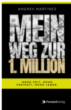
Mein Weg zur 1. Million Ladenpreis: 20,00EUR