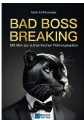
Bad Boss Breaking Ladenpreis: 20,60EUR