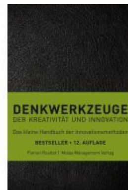
Denkwerkzeuge Ladenpreis: 25,70EUR