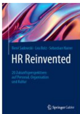
HR Reinvented Ladenpreis: 71,95EUR