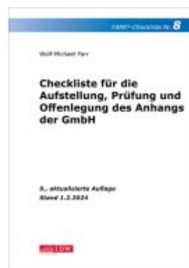
FARR Checkliste 8 für die Aufstellung, Prüfung und Offenlegung des Anhangs der GmbH Ladenpreis: 38,10EUR