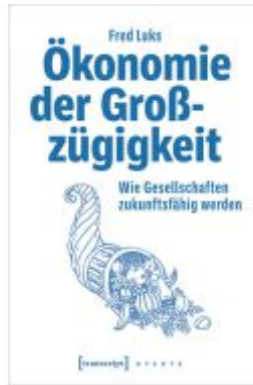
Ökonomie der Großzügigkeit Ladenpreis: 32,00EUR