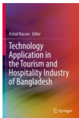
Technology Application in the Tourism and Hospitality Industry of Bangladesh Ladenpreis: 186,99EUR