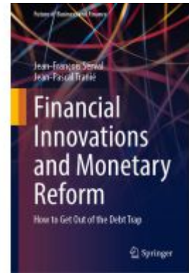
Financial Innovations and Monetary Reform Ladenpreis: 76,99EUR