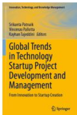
Global Trends in Technology Startup Project Development and Management Ladenpreis: 186,99EUR