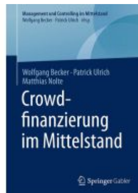
Crowdfinanzierung im Mittelstand Ladenpreis: 35,97EUR