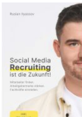
Social-Media-Recruiting ist die Zukunft! Ladenpreis: 24,90EUR