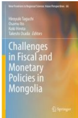
Challenges in Fiscal and Monetary Policies in Mongolia Ladenpreis: 164,99EUR