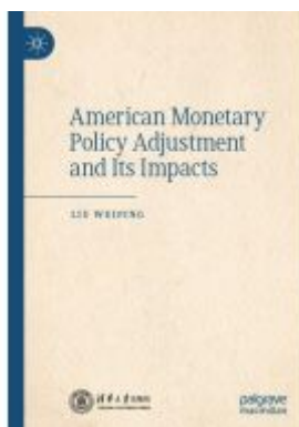
American Monetary Policy Adjustment and Its Impacts Ladenpreis: 120,99EUR