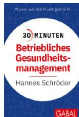
30 Minuten Betriebliches Gesundheitsmanagement (BGM) Ladenpreis: 11,30EUR