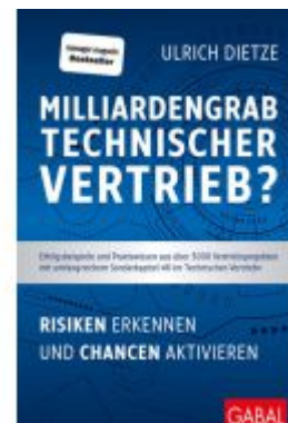
Milliardengrab Technischer Vertrieb? Ladenpreis: 32,90EUR