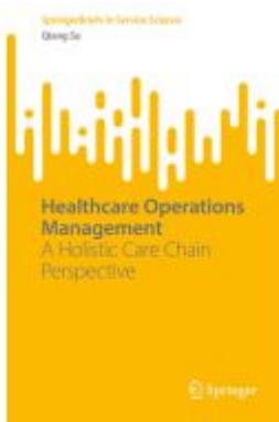
Healthcare Operations Management Ladenpreis: 54,99EUR