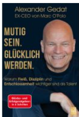
Mutig sein. Glücklich werden. Ladenpreis: 20,60EUR