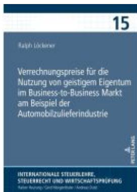
Verrechnungspreise für die Nutzung von geistigem Eigentum im Business-to- Business Markt am Beispiel der Automobilzulieferindustrie Ladenpreis: 71,90EUR