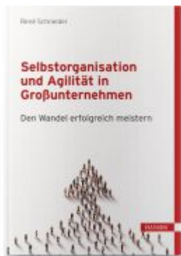
Selbstorganisation und Agilität in Großunternehmen Ladenpreis: 72,00EUR

Wir haben andere Produkte gefunden, die Ihnen gefallen könnten!