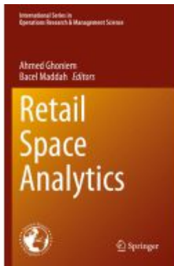
Retail Space Analytics Ladenpreis: 186,99EUR