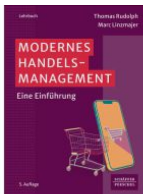
Modernes Handelsmanagement Ladenpreis: 41,20EUR