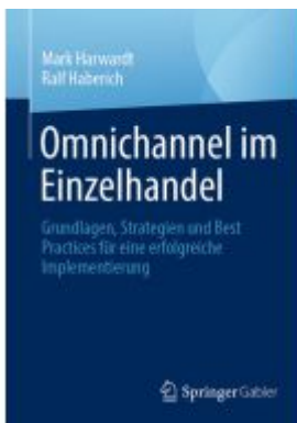
Omnichannel im Einzelhandel Ladenpreis: 35,97EUR