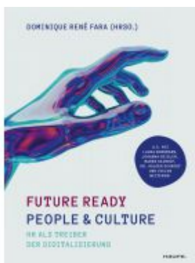
Future ready People & Culture Ladenpreis: 51,40EUR