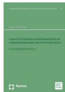
Impact of Corporate Social Responsibility on Corporate Reputation and Firm Performance Ladenpreis: 60,70EUR