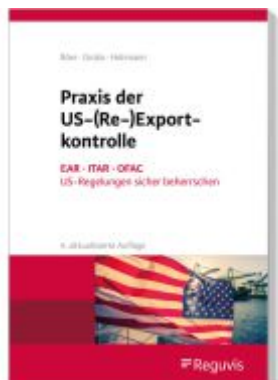
Praxis der US-(Re-)Exportkontrolle Ladenpreis: 60,70EUR