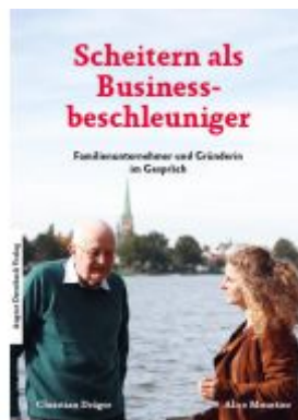
Scheitern als Businessbeschleuniger Ladenpreis: 19,60EUR