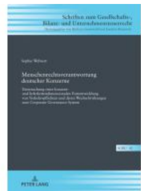
Menschenrechtsverantwortung deutscher Konzerne Ladenpreis: 71,90EUR