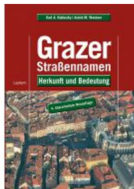
Grazer Straßennamen – Herkunft und Bedeutung Ladenpreis: 29,90 EUR