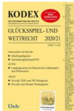
KODEX Glücksspiel- und Wettrecht 2020/21 Ladenpreis: 68,00 EUR