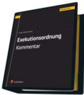
Exekutionsordnung - Kommentar Ladenpreis: 623,00 EUR