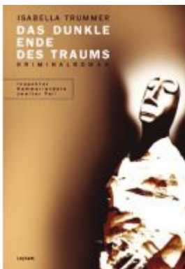
Das dunkle Ende des Traums Ladenpreis: 19,90 EUR