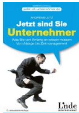
Jetzt sind Sie Unternehmer Ladenpreis: 19,90 EUR