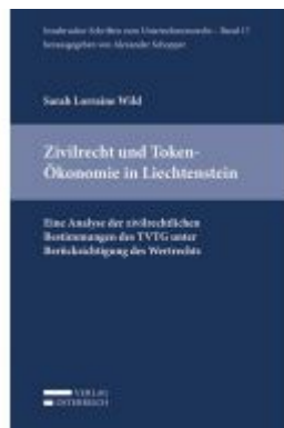
Zivilrecht und Token-Ökonomie in Liechtenstein Ladenpreis: 39,00 EUR