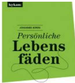
Persönliche Lebensfäden Ladenpreis: 18,00 EUR

Wir haben andere Produkte gefunden, die Ihnen gefallen könnten!