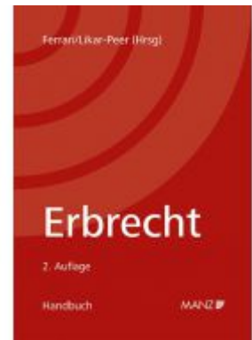
Erbrecht Ladenpreis: 160,00 EUR