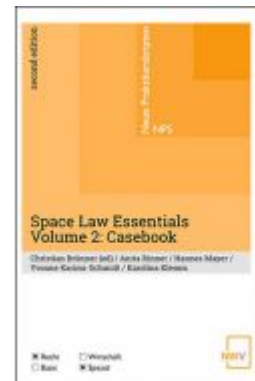
Space Law Essentials Volume 2 Casebook Ladenpreis: 19,00 EUR