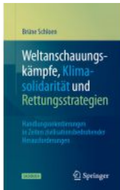
Weltanschauungskämpfe, Klimasolidarität und Rettungsstrategien Ladenpreis: 20,55EUR

Wir haben andere Produkte gefunden, die Ihnen gefallen könnten!