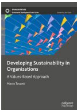
Developing Sustainability in Organizations Ladenpreis: 164,99EUR