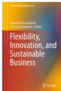
Flexibility, Innovation, and Sustainable Business Ladenpreis: 109,99EUR