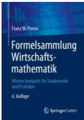
Formelsammlung Wirtschaftsmathematik Ladenpreis: 30,83EUR