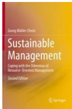
Sustainable Management Ladenpreis: 93,49EUR