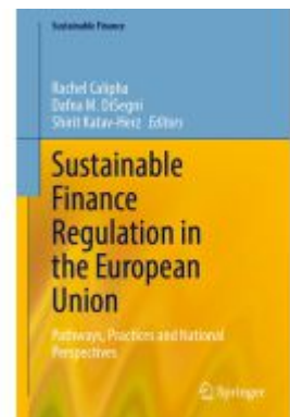
Sustainable Finance Regulation in the European Union Ladenpreis: 164,99EUR