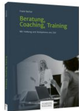
Beratung, Coaching, Training Ladenpreis: 30,80EUR