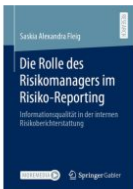
Die Rolle des Risikomanagers im Risiko-Reporting