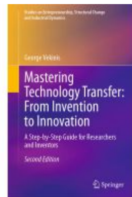
Mastering Technology Transfer: From Invention to Innovation