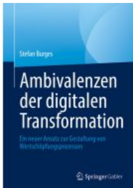
Ambivalenzen der digitalen Transformation Ladenpreis: 56,53EUR

Wir haben andere Produkte gefunden, die Ihnen gefallen könnten!