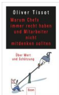
Warum Chefs immer recht haben und Mitarbeiter nicht mitdenken sollten