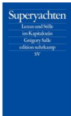
Superyachten Ladenpreis: 16,50EUR