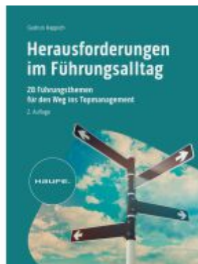
Herausforderungen im Führungsalltag