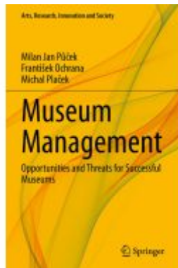
Museum Management Ladenpreis: 54,99EUR