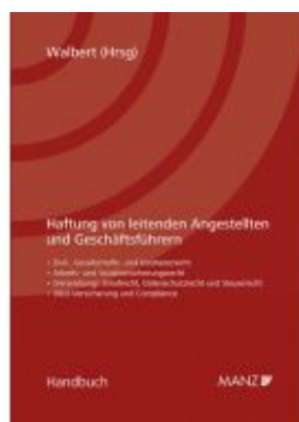
Haftung von leitenden Angestellten und Geschäftsführern Ladenpreis: 98,00 EUR