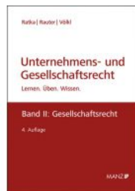
Unternehmens- und Gesellschaftsrecht Ladenpreis: 63,00 EUR