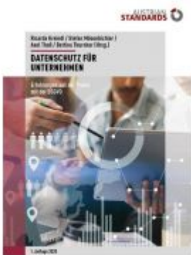
Datenschutz für Unternehmen Ladenpreis: 59,00 EUR

Wir haben andere Produkte gefunden, die Ihnen gefallen könnten!