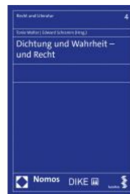
Dichtung und Wahrheit □ und Recht Ladenpreis: 53,50 EUR