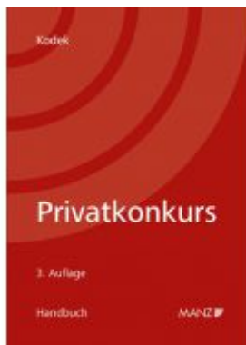
Handbuch Privatkonkurs Ladenpreis: 105,00 EUR