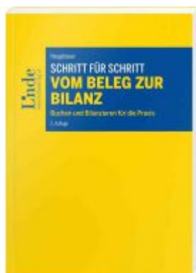
Schritt für Schritt vom Beleg zur Bilanz Ladenpreis: 38,00 EUR