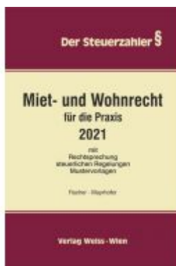
Miet- und Wohnrecht für die Praxis Ladenpreis: 69,30 EUR