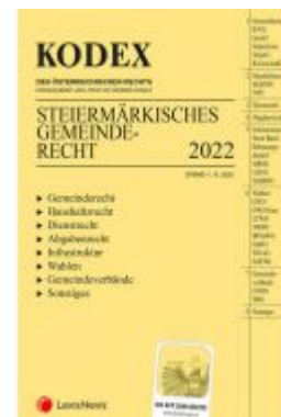
KODEX Steiermärkisches Gemeinderecht 2022 - inkl. App Ladenpreis: 87,00 EUR