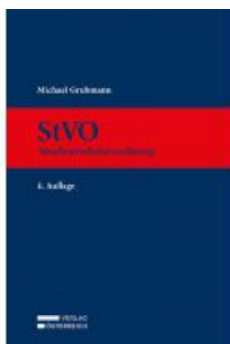
StVO Ladenpreis: 349,00 EUR