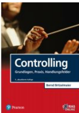
Controlling Ladenpreis: 39,95EUR