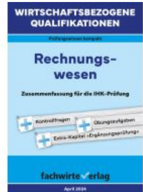
Wirtschaftsbezogene Qualifikationen: Rechnungswesen Ladenpreis: 12,40EUR