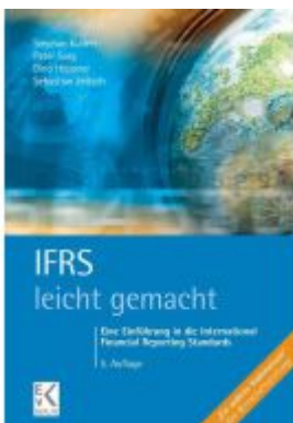
IFRS – leicht gemacht. Ladenpreis: 16,40EUR