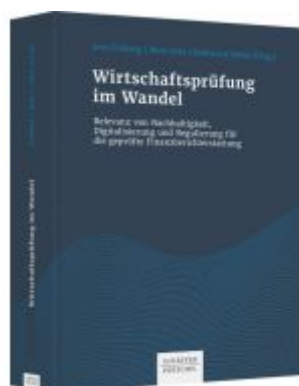
Wirtschaftsprüfung im Wandel Ladenpreis: 123,40EUR