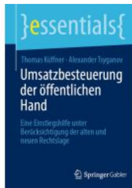
Umsatzbesteuerung der öffentlichen Hand Ladenpreis: 15,41EUR