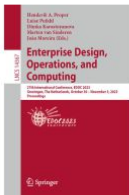
Enterprise Design, Operations, and Computing Ladenpreis: 63,79EUR