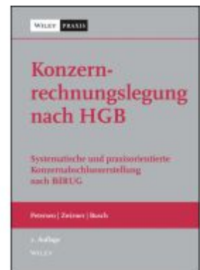
Konzernrechnungslegung nach HGB Ladenpreis: 36,00EUR