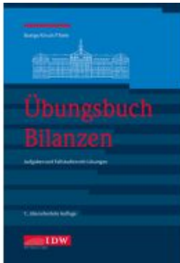
Übungsbuch Bilanzen, 7. Ladenpreis: 44,30EUR

Wir haben andere Produkte gefunden, die Ihnen gefallen könnten!