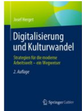
Digitalisierung und Kulturwandel Ladenpreis: 41,11EUR