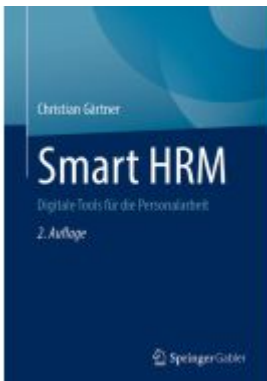
Smart HRM Ladenpreis: 46,25EUR