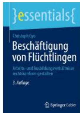
Beschäftigung von Flüchtlingen Ladenpreis: 15,41EUR