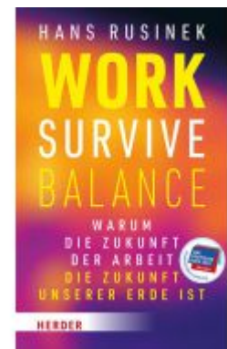
Work-Survive-Balance Ladenpreis: 22,70EUR