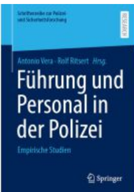
Führung und Personal in der Polizei Ladenpreis: 113,07EUR