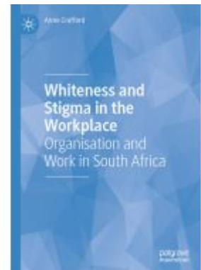
Whiteness and Stigma in the Workplace Ladenpreis: 109,99EUR