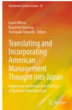
Translating and Incorporating American Management Thought into Japan Ladenpreis: 109,99EUR