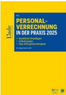
Personalverrechnung in der Praxis 2025 Ladenpreis: 124,00EUR