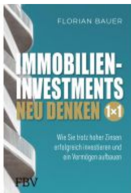
Immobilieninvestments neu denken – Das 1×1 Ladenpreis: 25,80EUR