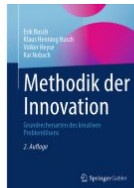
Methodik der Innovation Ladenpreis: 56,53EUR