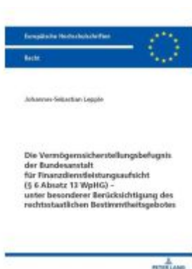
Die Vermögenssicherstellungsbefugnis der Bundesanstalt für Finanzdienstleistungsaufsicht (§ 6 Absatz 13 WpHG) – unter besonderer Berücksichtigung des rechtsstaatlichen Bestimmtheitsgebotes Ladenpreis: 46,20EUR