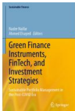
Green Finance Instruments, FinTech, and Investment Strategies Ladenpreis: 76,99EUR

Wir haben andere Produkte gefunden, die Ihnen gefallen könnten!