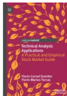
Technical Analysis Applications Ladenpreis: 54,99EUR