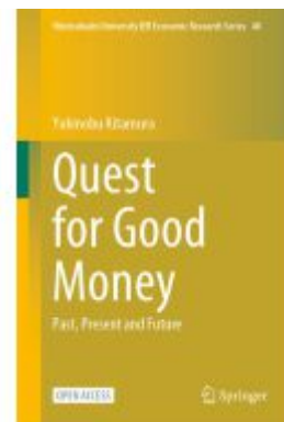
Quest for Good Money Ladenpreis: 54,99EUR