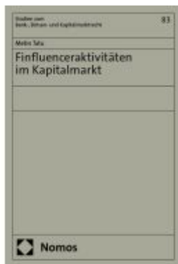
Finfluenceraktivitäten im Kapitalmarkt Ladenpreis: 122,40EUR