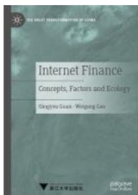
Internet Finance Ladenpreis: 109,99EUR