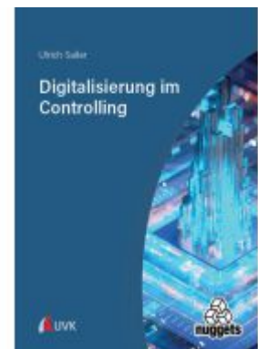
Digitalisierung im Controlling Ladenpreis: 18,50EUR