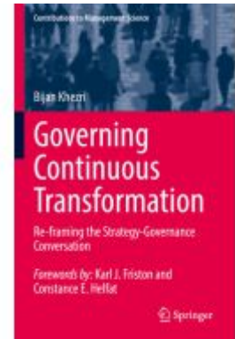
Governing Continuous Transformation Ladenpreis: 120,99EUR