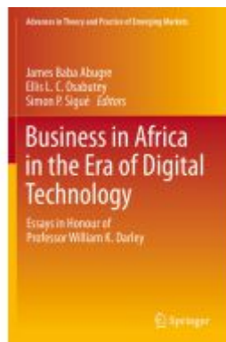
Business in Africa in the Era of Digital Technology Ladenpreis: 186,99EUR