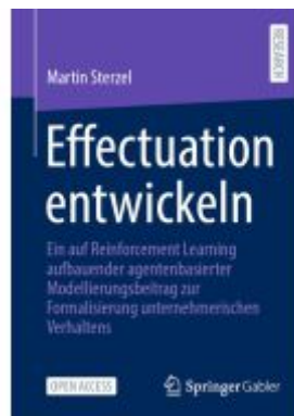
Effectuation entwickeln Ladenpreis: 43,99EUR