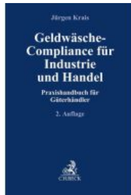
Geldwäsche-Compliance für Industrie und Handel Ladenpreis: 91,50EUR