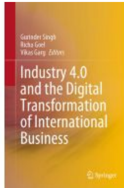
Industry 4.0 and the Digital Transformation of International Business Ladenpreis: 175,99EUR