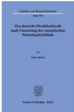
Das deutsche Pferdekaufrecht nach Umsetzung der europäischen Warenkaufrichtlinie. Ladenpreis: 71,90EUR