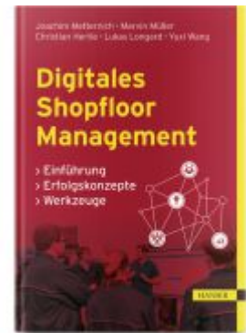
Digitales Shopfloor Management Ladenpreis: 82,30EUR