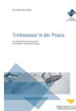
Trinkwasser in der Praxis Ladenpreis: 132,70EUR