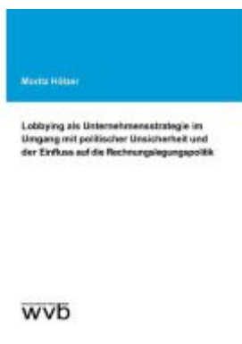
Lobbying als Unternehmensstrategie im Umgang mit politischer Unsicherheit und der Einfluss auf die Rechnungslegungspolitik Ladenpreis: 39,10EUR