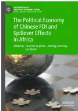
The Political Economy of Chinese FDI and Spillover Effects in Africa Ladenpreis: 164,99EUR