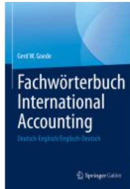
Fachwörterbuch International Accounting Ladenpreis: 205,60EUR