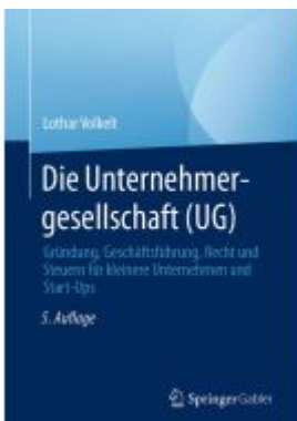
Die Unternehmergesellschaft (UG) Ladenpreis: 56,53EUR