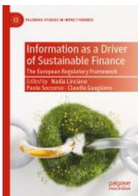
Information as a Driver of Sustainable Finance Ladenpreis: 175,99EUR