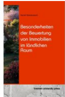
Besonderheiten der Bewertung von Immobilien im ländlichen Raum Ladenpreis: 30,90EUR