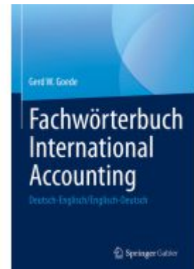
Fachwörterbuch International Accounting Ladenpreis: 205,60EUR