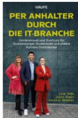
Per Anhalter durch die IT-Branche Ladenpreis: 20,60EUR