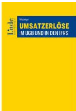
Umsatzerlöse im UGB und in den IFRS Ladenpreis: 78,00EUR