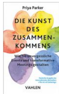
Die Kunst des Zusammenkommens - The Art of Gathering Ladenpreis: 25,60EUR