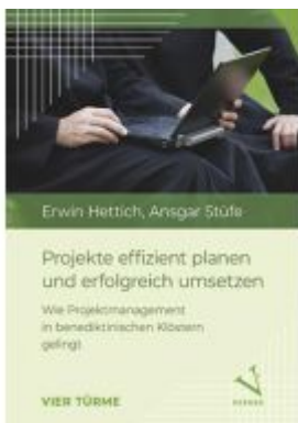
Projekte effizient planen und erfolgreich umsetzen Ladenpreis: 18,00EUR