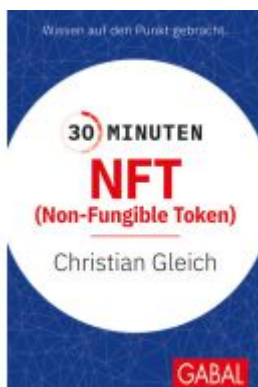
30 Minuten NFT (Non-Fungible Token) Ladenpreis: 11,30EUR