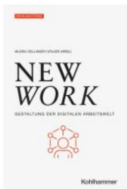
New Work Ladenpreis: 35,00EUR