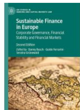
Sustainable Finance in Europe Ladenpreis: 219,99EUR