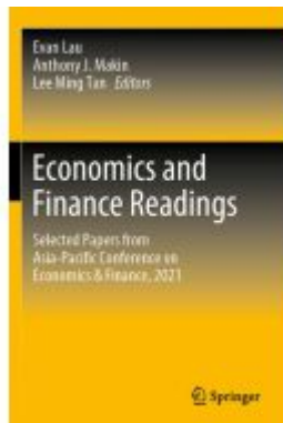
Economics and Finance Readings Ladenpreis: 197,99EUR

Wir haben andere Produkte gefunden, die Ihnen gefallen könnten!