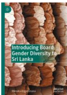
Introducing Board Gender Diversity to Sri Lanka Ladenpreis: 164,99EUR