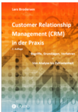
Customer Relationship Management (CRM) in der Praxis Ladenpreis: 29,90EUR