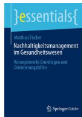
Nachhaltigkeitsmanagement im Gesundheitswesen Ladenpreis: 15,41EUR