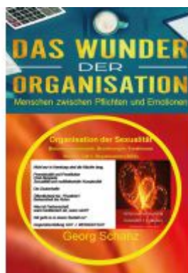
Das Wunder der Organisation - Band 5 Ladenpreis: 32,90EUR