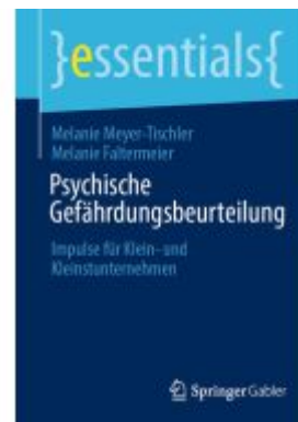
Psychische Gefährdungsbeurteilung Ladenpreis: 15,41EUR