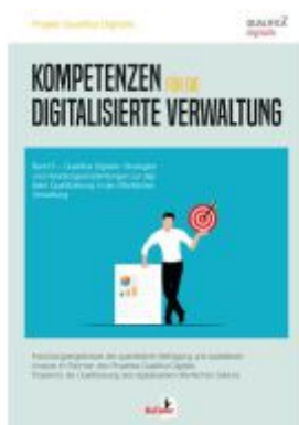
Kompetenzen für die digitalisierte Verwaltung Ladenpreis: 17,40EUR