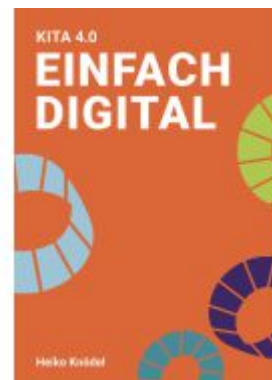
Kita 4.0 – einfach digital Ladenpreis: 20,60EUR