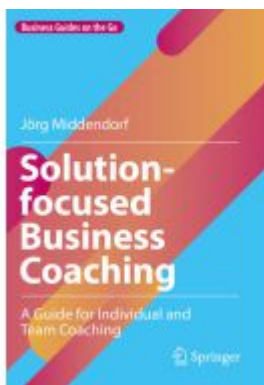
Solution-focused Business Coaching Ladenpreis: 43,99EUR